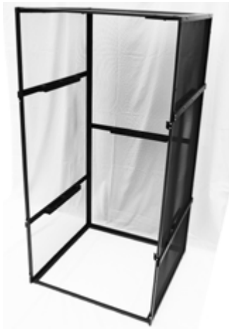
2) Add Side Panels (B) and (D) with 3/4" screws. Stickers are on the inside top of the panel. Attach to Top Panel (E) first to avoid slipping and possible screen damage to Top Panel.