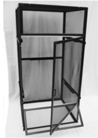
3) Complete Front by first installing the Service Door (G2) with two 3/4" screws from the sides. Then install the Upper Face Panel (G1). Finally, lay the door in and use four flathead 1/4" screws to attach to hinges. 4) Slide in Floor Panel (F)

Your Large Clearside Enclosure is complete!