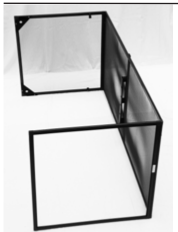
1) Construct cage core with Back Panel (A), Top Panel (E), and Bottom Frame (C). Use 3/4" screws from cage screw bag. Bottom Frame sticker is on outside. Other panels are installed with stickers on inside.