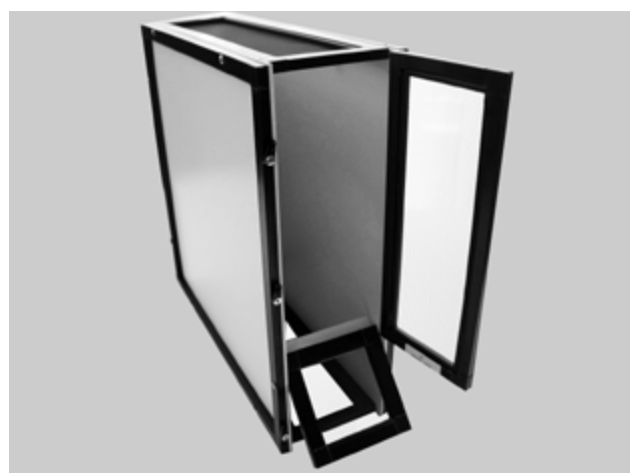
3) Complete Front by first installing the Service Door (G) with two 3/4" screws from the sides. Finally, lay the door in and use four flathead 1/4" screws to attach to hinges. 4) Slide in Floor Panel (F)

Repeat twice and sit your cages in the Drainage Tray to complete your Compact Cage System!