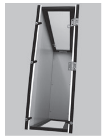
2) Add Side Panels (B) and (D) with 3/4" screws. Stickers are on the inside top of the panel. Attach to Top Panel (E) first to avoid slipping and possible screen damage to Top Panel.