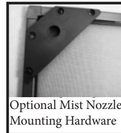
Optional Mist Nozzle Mounting Hardware

C) Remove Stickers: If you desire to remove the frame stickers, carefully pry as much off as possible and use Goo Gone or WD-40 to rub off the adhesive.